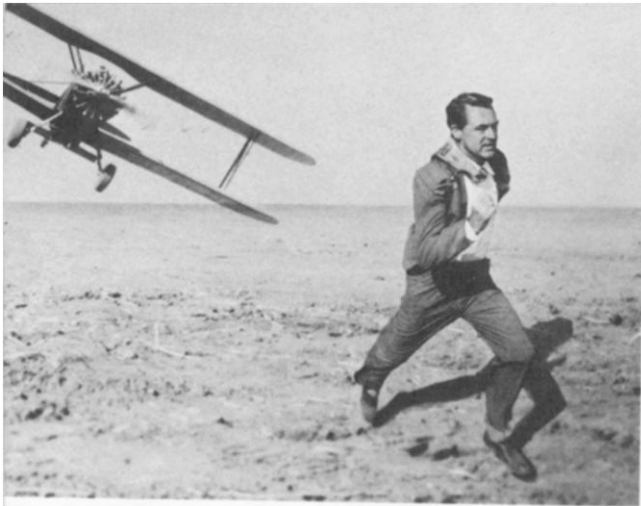
NORTH BY NORTHWEST.

are played with splendid sophistication and brio . The mocking, cynical script of Ernest Lehman, Robert Burks's photography, and above all the pounding score of Bernard Herrmann, admirably serve Hitchcock's requirements.