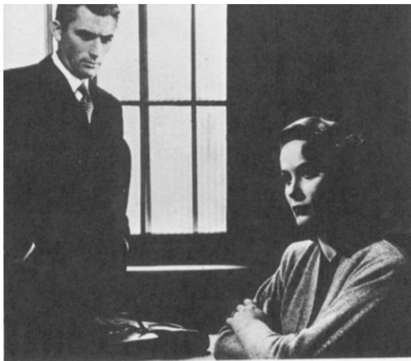
Gregory Peck, Alida Valli: THE PARADINE CASE .