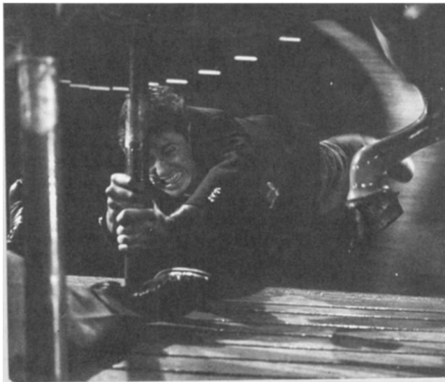
Farley Granger in STRANGERS ON A TRAIN.